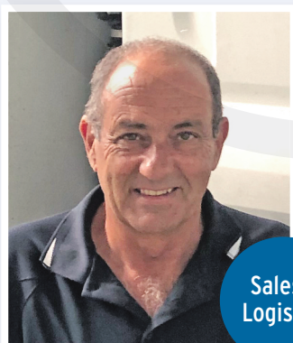
Sales & Logistics