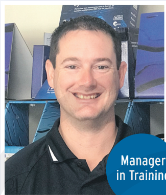
Manager in Training